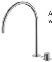
Anson Sink Spout pairs with Anson Hob Mixer