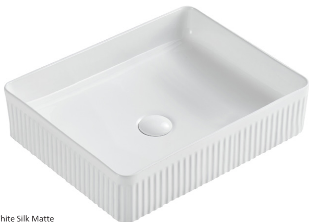
White Silk Matte