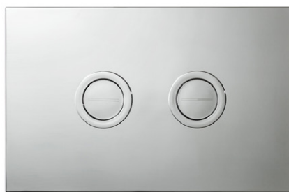
Chrome plated metal