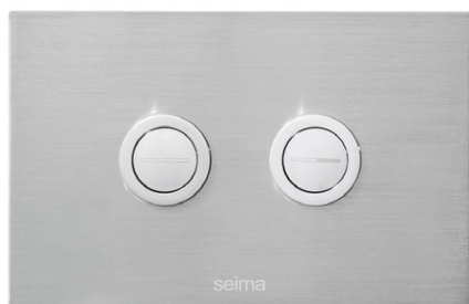
Brushed stainless steel