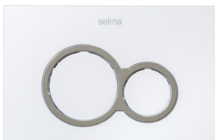
White gloss finish