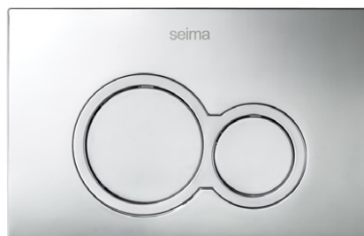
Chrome metallic finish