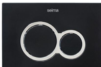
Black semi-matte finish