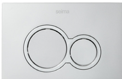
Satin metallic silver finish