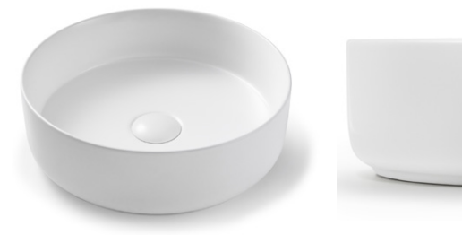
White Silk Matte: White silk matte interior and exterior