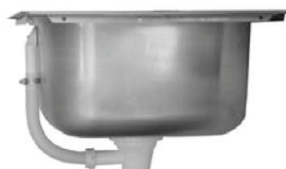
Optional overflow version